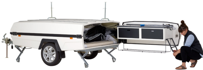
1 The built in kitchen swings out - all kitchen models can be used en-route.

Three simple steps and a matter of minutes – and you're ready to enjoy your holiday. A built in spring system means one person can open a Camp-let with no need for additional assistance.