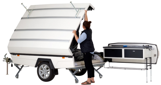
2 The trailer opens up. A practical spring system helps you open and close the trailer.