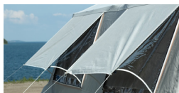
Ventilation in the sleeping compartments and kitchen