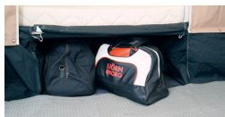
Optimal storage areas