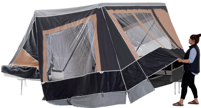
3 The large awning and sleeping compartments open in a single movement.